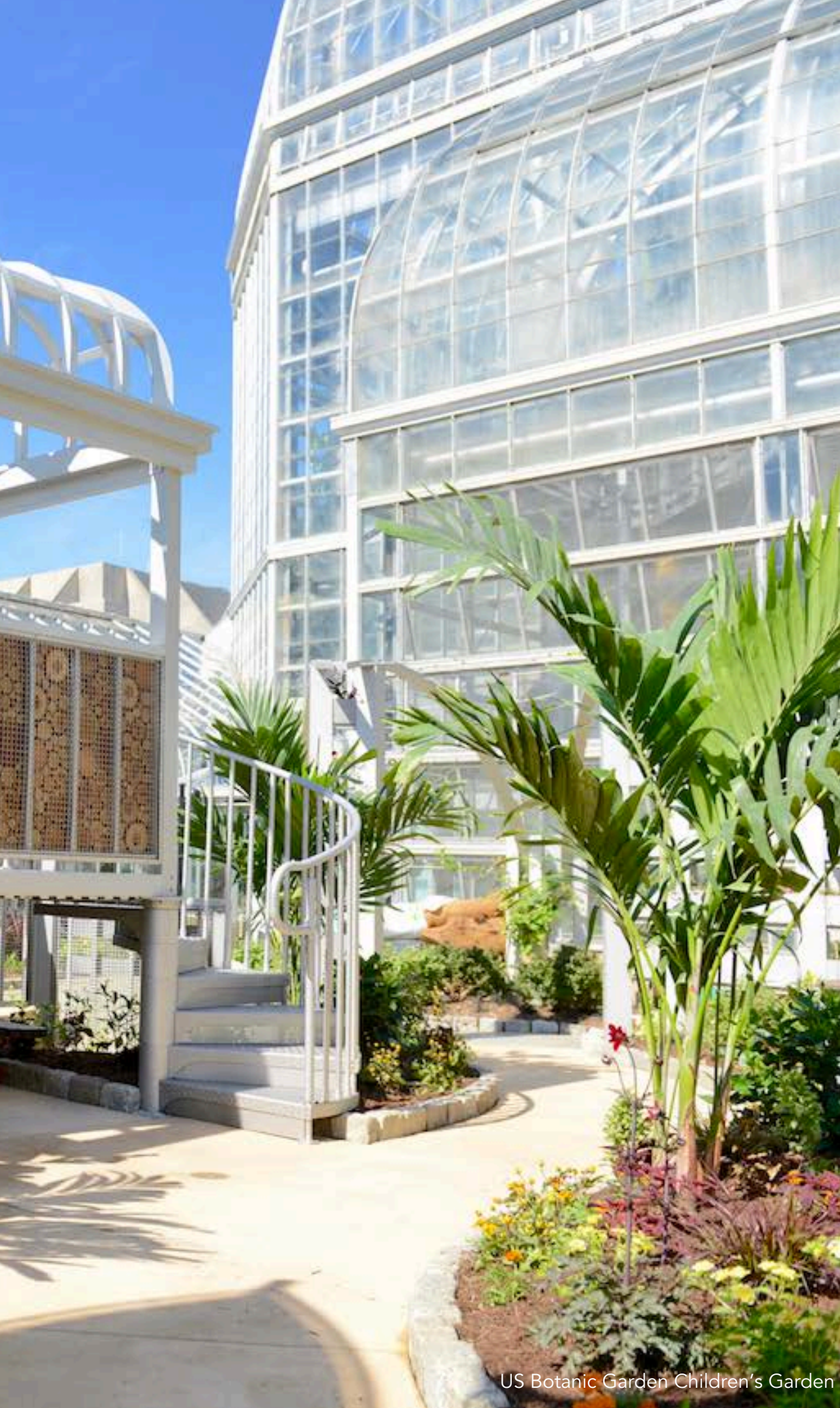
US Botanic Garden Children's Garden