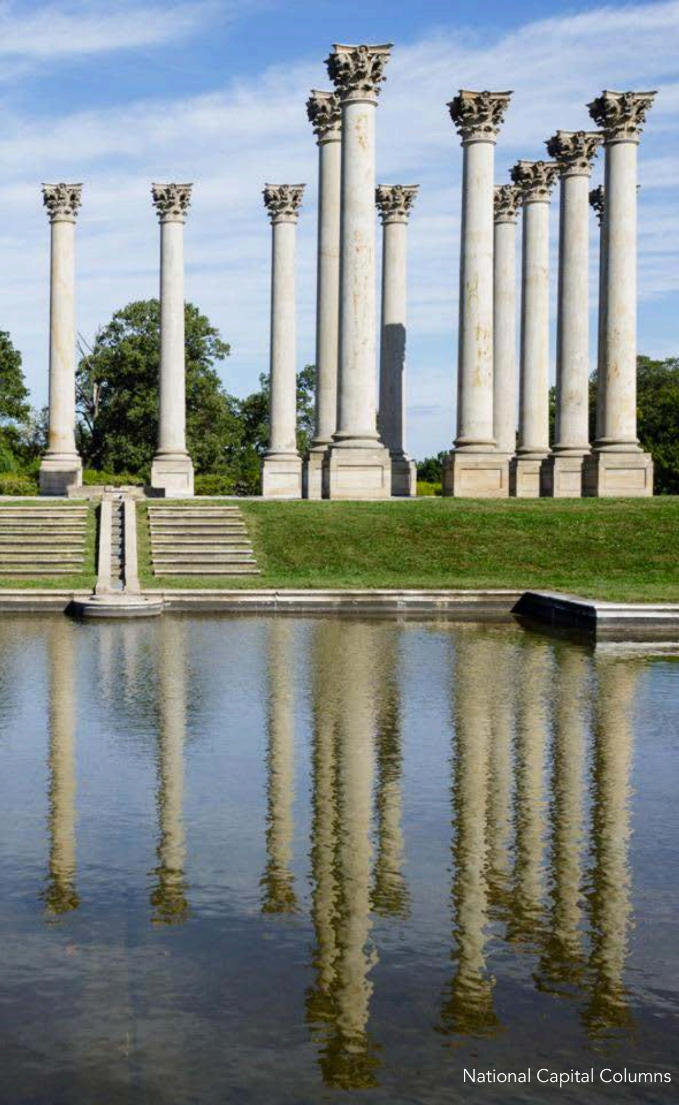
National Capital Columns