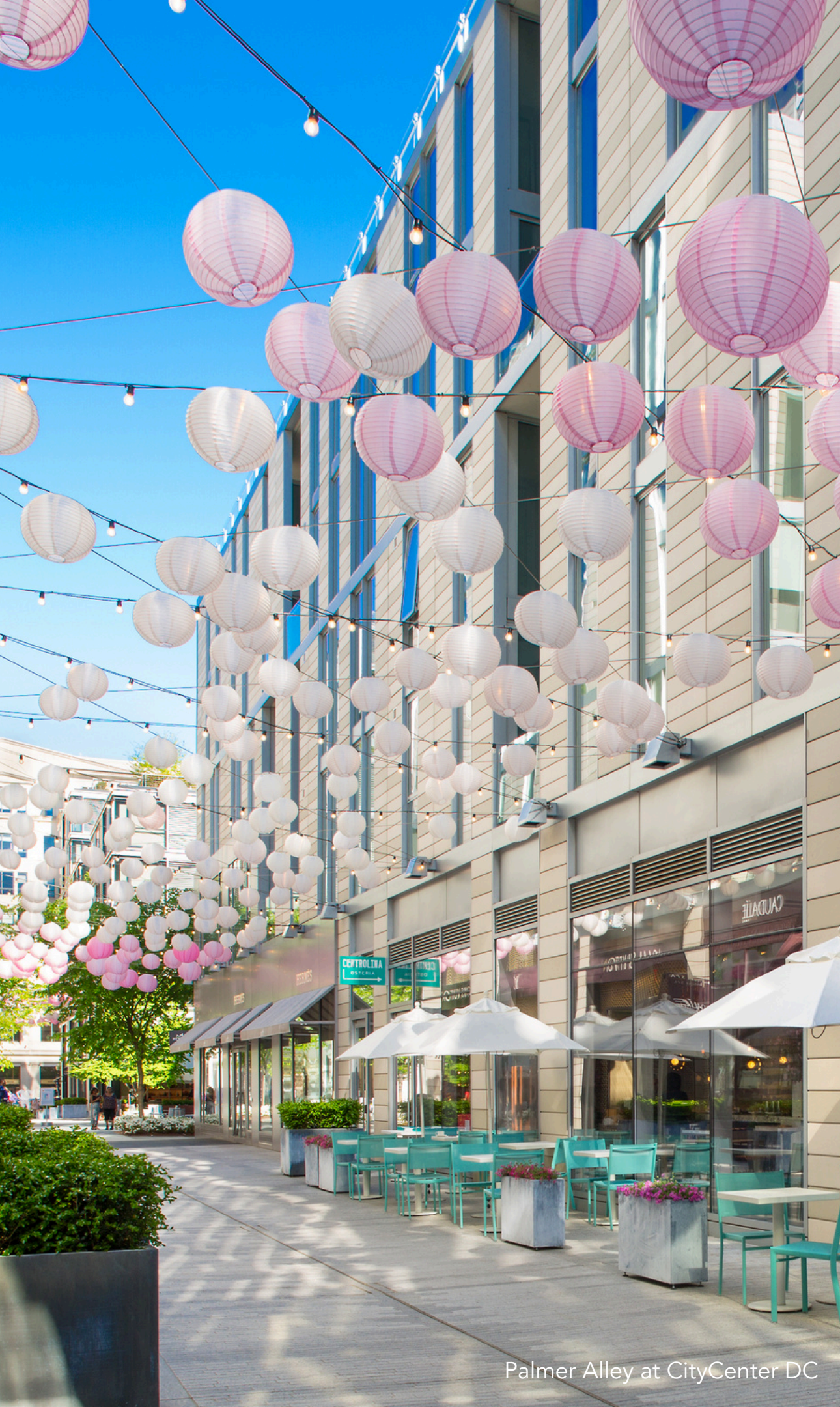
Palmer Alley at CityCenter DC