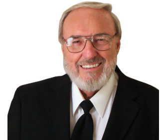
Yisrayl Hawkins THE HOUSE OF YAHWEH

In a new report from the President’s National Infrastructure Advisory Council and published by the Department of Homeland Security, the government is urging the public to prepare for the up to six months without electricity, transportation, fuel, money, and healthcare.