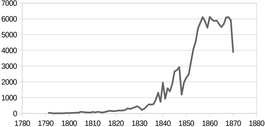
Patents and certificates of addition granted in France (1791-1870)