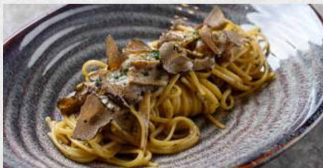
Truffle Spaghetti 600.- Truffle & Porcini Mushroom, Grada Padano Cheese & Truffle Oil