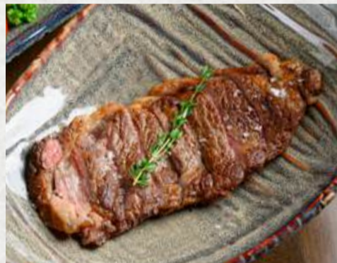
Striploin 1200.- Black Angus Striploin, French Fries and Beef Peppercorn Sauce