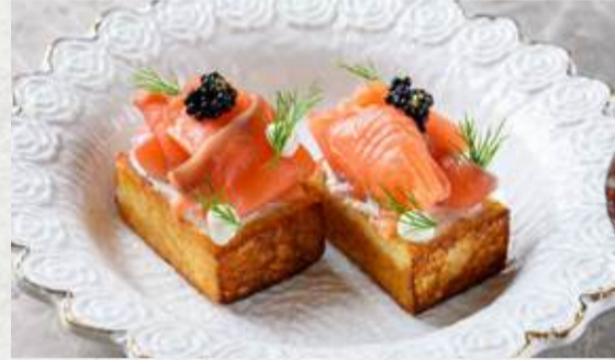
SALMON TOAST 200.- New Zealand Smoked Salmon, Buttered Brioche, Yogurt Dill Sauce