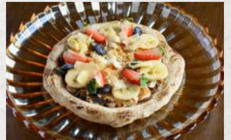
Chocolate Pizza 300.- Home-made Dark Chocolate Brownie with Madagascar Vanilla Ice Cream