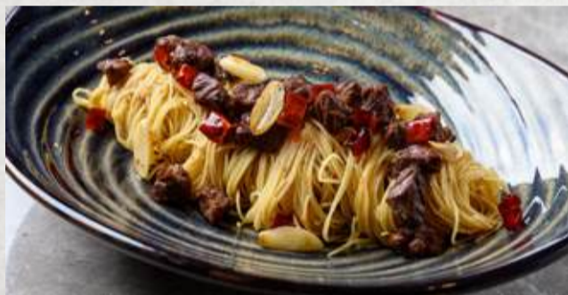
Angel Hair 480.- Grilled Angus Beef, Aglio e Olio