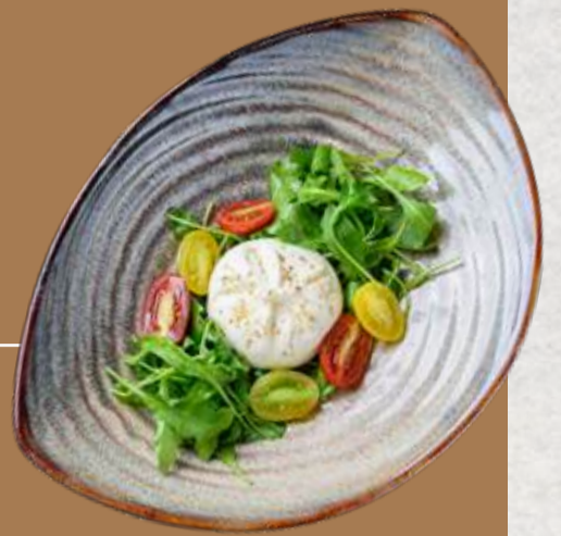
Burrata 450.- Phuket Burrata, Wild Rocket, Berry Tomato & White Balsamic