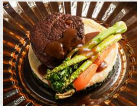
Tenderloin 1400.- Black Angus Tenderloin, Spanish, Mashed Potato, Grilled Asparagus