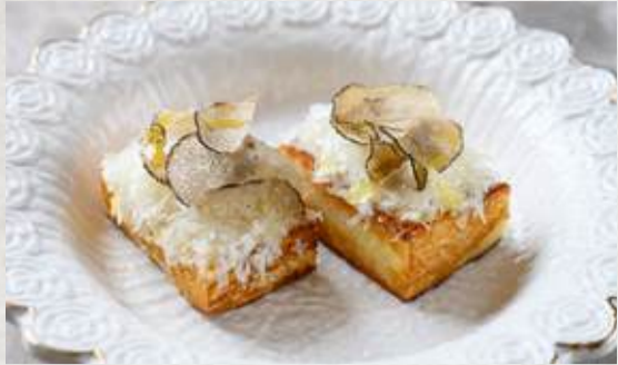
TRUFFLE TOAST 200.- Buttered Brioche, Truffle Aioli & Grada Padano Flake