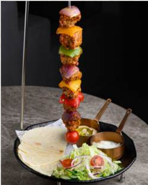
Chicken Kebab 420.- Roasted Marinated Chicken Tight, Pita Bread, Tzatziki, Hummus, Masala Spices & Mixed Green