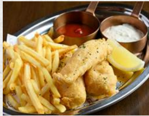
Fish & Chip 450.- Deep Fried Seabass, French Fries, Thousands Island Sauce