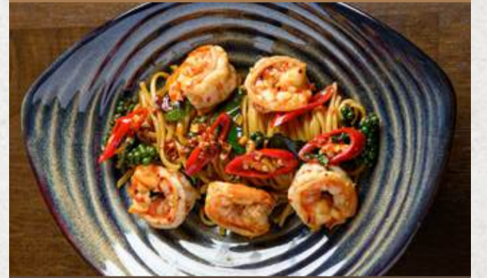
Pad Kee Mao Spaghetti

Choice of Chicken, Shrimp, Beef or Tofu (V.) Peppercorn, Chili, Makrut Leaves & Homemade Thai Sauce