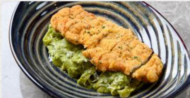
Chicken Pesto Fettuccine 450.- Chicken Schnitzel, Grada Padano Cheese & Pesto Sauce