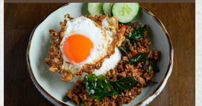
Pad Kra Prao

Choice of Chicken, Beef, Shrimp or Tofu (V.) Fried Egg, Thai Basil, Fresh Chili & Oyster Sauce