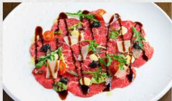
BEEF CARPACCIO 580.- Black Angus Tenderloin, Tomato, Truffle Wild Rocket, Yolk Mustard Aioli, Grada Padano