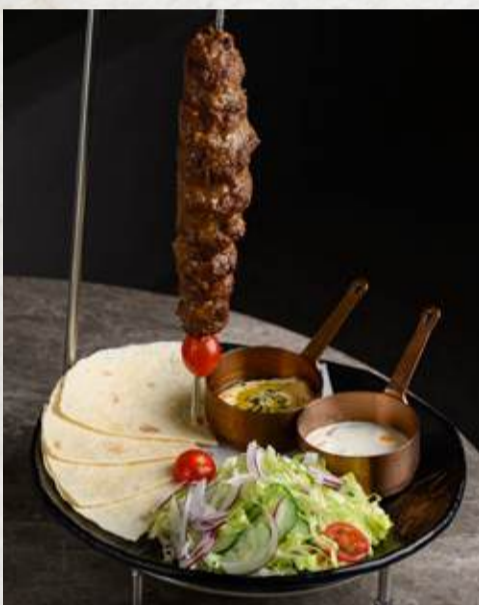
Beef Kebab 480.- Roasted Marinated Minced Beef, Pita Bread, Tzatziki, Hummus, Masala Spices & Mixed Green