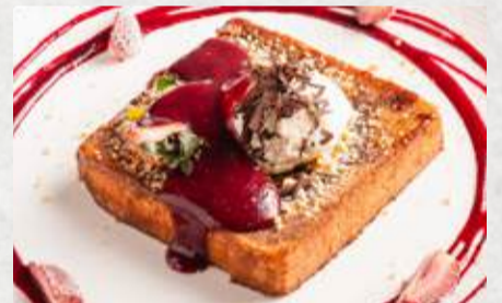
Lucca Strawberry Honey Toast 270.- Brioche Toast, Strawberry Sauce, Madagascar Vanilla Ice Cream & Crumbles