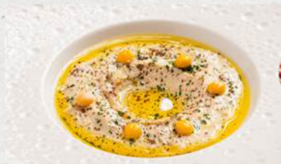
HUMMUS DIP 320.- Sourdough & Vegetable