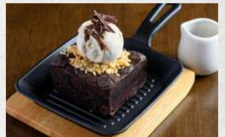
Dark Chocolate Brownie 270.- Home-made Dark Chocolate Brownie with Madagascar Vanilla Ice Cream