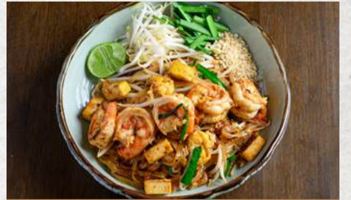
Pad Thai Goong or Tofu (v.)

Shrimp, Rice Noodles, Egg, Tofu, Bean Sprout, Chinese Chives, Peanut & Tamarind Sauce