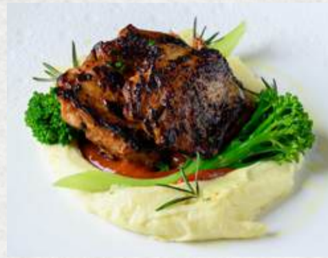
Chicken Steak 480.- Grilled Chicken Tight, BBQ Sauce, Mashed Potatoes & Broccolini