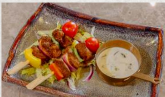
LAMB SKEWER 360.- Cucumber Yoghurt