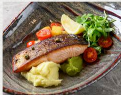
Grilled Salmon 650.- Salmon Steak, Mashed Potato & Rocket Salad