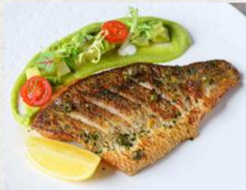
Grilled Seabass 650.- Seabass Fillet, Wild Rocket, Potato, Board Bean Purée, Asparagus & Yogurt