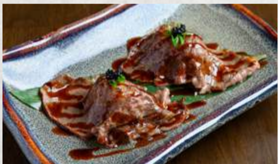
BEEF SUSHI 200.- Angus Beef, Japanese Rice, Wasabi & Teriyaki Sauce