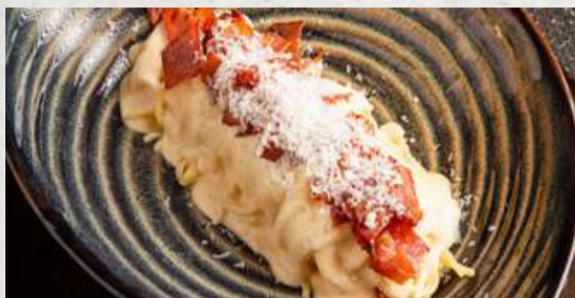
Spaghetti Carbonara 350.- Crispy Pastrami, Egg, Cream, Grana Padano