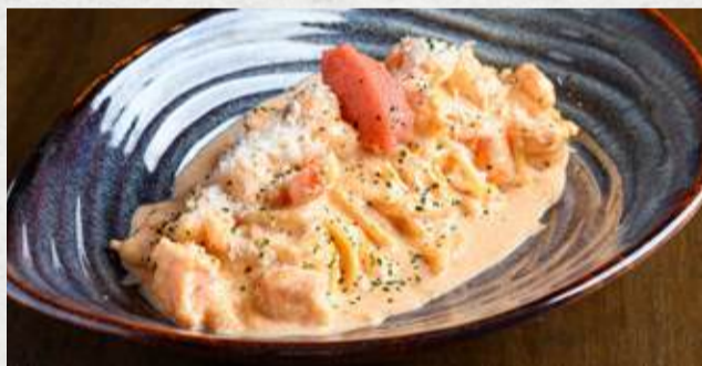
Creamy Spaghetti 450.- Mentaiko, Ebiko, White Cream Sauce, Grada Padano