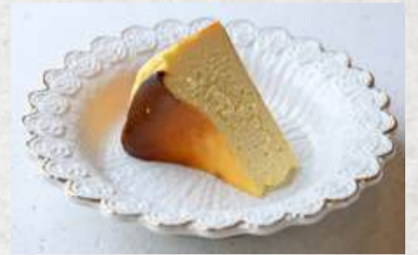
Brunt Cheesecake 290.- Choice of Raspberry Chocolate Sauce or Chocolate Sauce