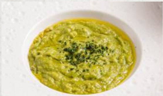
GUACAMOLE DIP 360.- Nacho