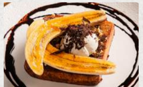
Lucca Banana Honey Toast 270.- Brioche Toast, Chocolate Sauce, Madagascar Vanilla Ice Cream & Crumbles