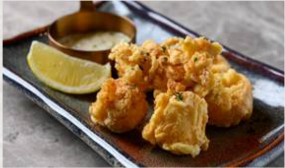
CALAMARI 290.- Deep Fried Calamari, Homemade Mayonnaise Sauce