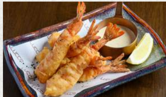
CRISPY SHRIMP 320.- Deep Fried Shrimp, Lemon Mustard Mayonnaise