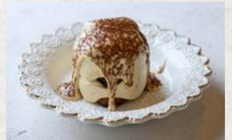
Lava Tiramisu 270.- Lucca Brand Coffee Tiramisu, Lady Finger, Crumbles & Mascarpone