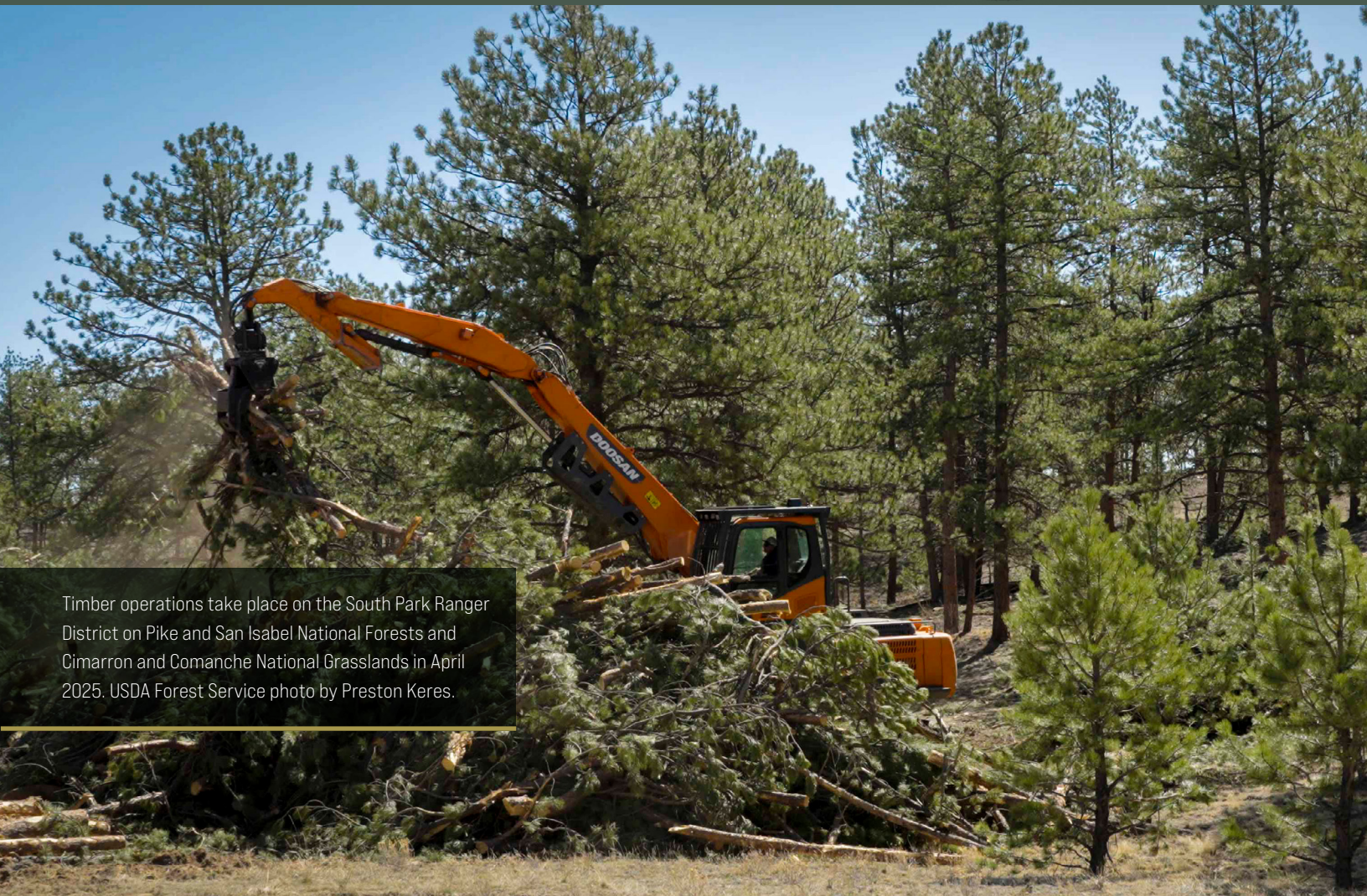
Timber operations take place on the South Park Ranger District on Pike and San Isabel National Forests and Cimarron and Comanche National Grasslands in April 2025.