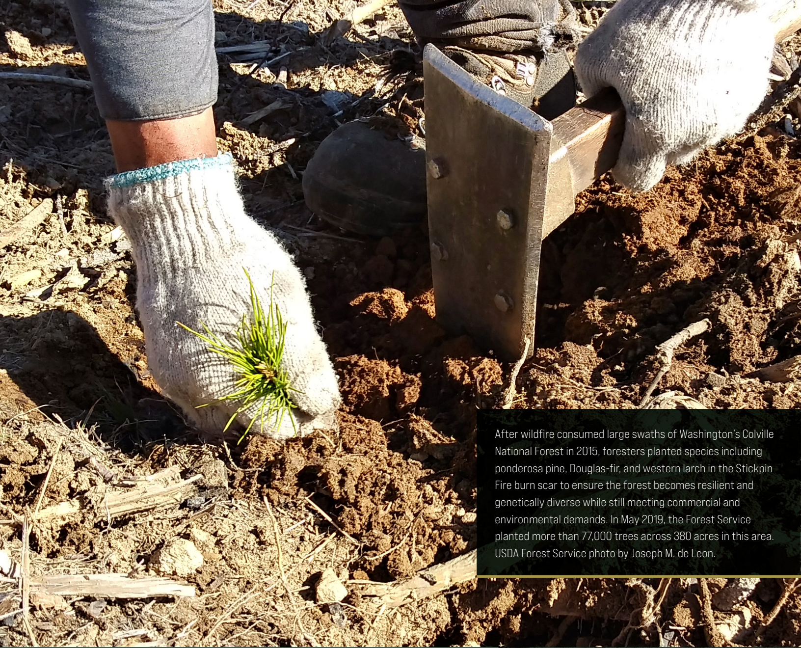
After wildfire consumed large swaths of Washington's Colville National Forest in 2015, foresters planted species including ponderosa pine, Douglas-fir, and western larch in the Stickpin Fire burn scar to ensure the forest becomes resilient and genetically diverse while still meeting commercial and environmental demands. In May 2019, the Forest Service planted more than 77,000 trees across 380 acres in this area.