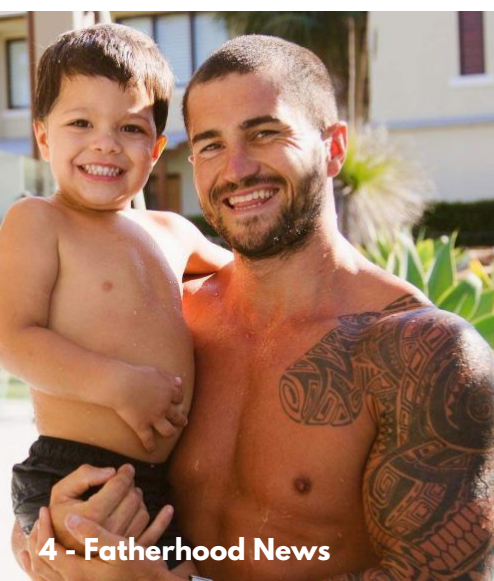
4 - Fatherhood News