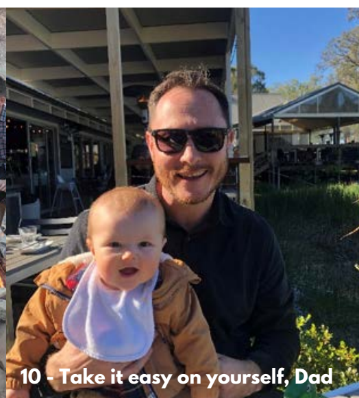
10 - Take it easy on yourself, Dad