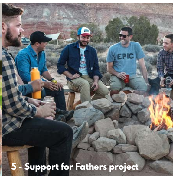
5 - Support for Fathers project