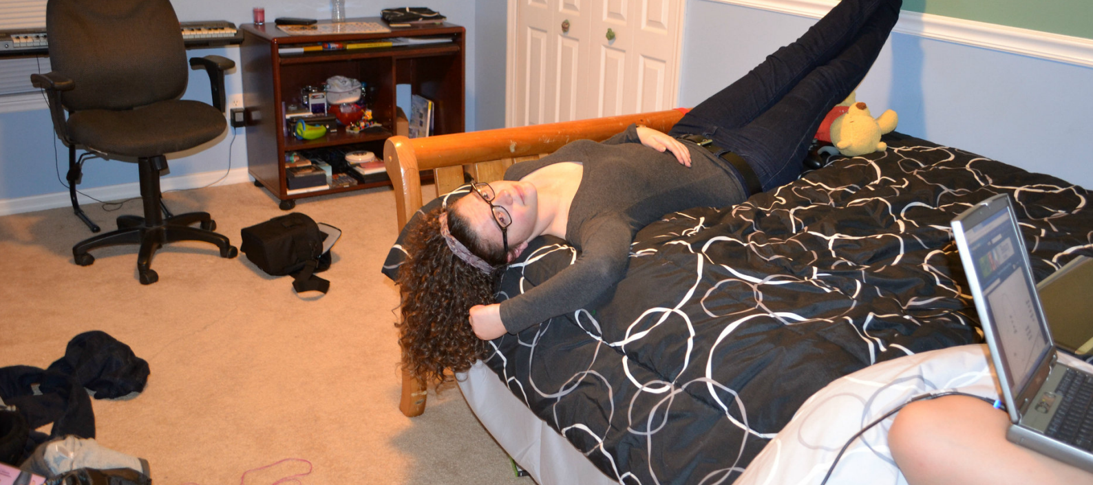
Jasmine's Room